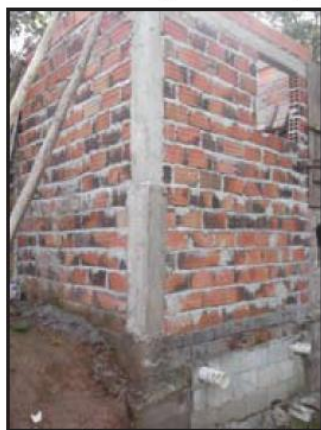
(Bathroom wall with outside drainage)

With no ventilation the mold just takes over and creates a breeding ground for all sorts of health issues.