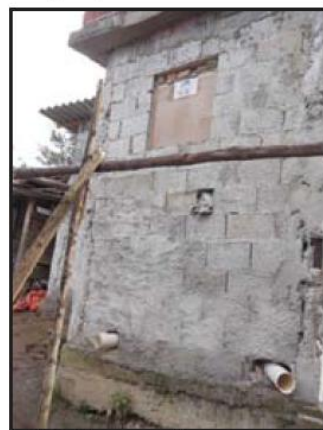
(Kitchen wall going up)

This is not a mansion; just a sturdy and safe shelter for this family. It now has actual windows; this is something very important because of the extreme high humidity.