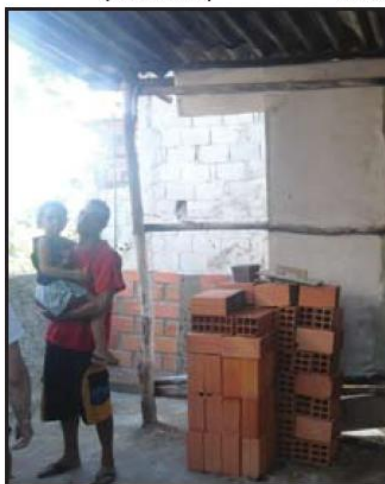
(What's left of a house)

We were more than willing to help restore this family; they are making the effort to restore their home life and we will make the effort to restore the building.