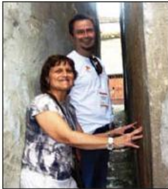
(Getting there is half the battle)

We were to visit other communities but there was not a resident of them to accompany us so we had to stay out. We were able to go to other homes and visited other families that day but the biggest impact was the last house we visited. We walked down a narrow path and came upon a house in back behind 3 other houses.