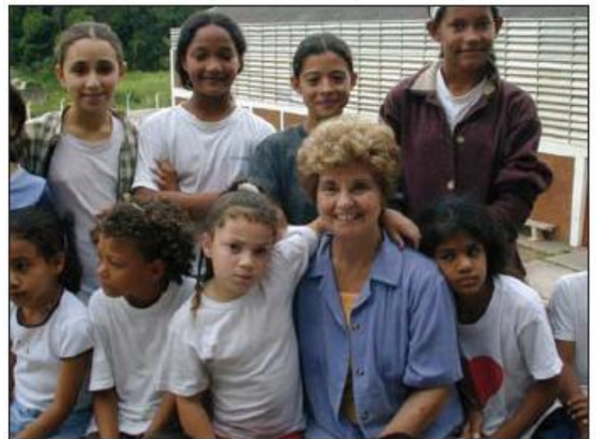
(Mom & Her Girls)

I guess the old saying, "your parents know best" was correct for our lives. We were changed for the better and are dedicating our lives to the good work.