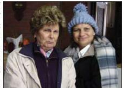
(Mom & Me)

Every day I miss my mother and every day I am thankful for what she taught us. Her and my father dedicated their lives to God and Brazil and dragged us kicking and screaming along with them